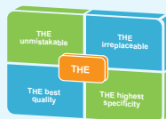
Image & Quantify

Automated Western Blotting device completing the entire process of blocking, antibody incubation and washing steps.